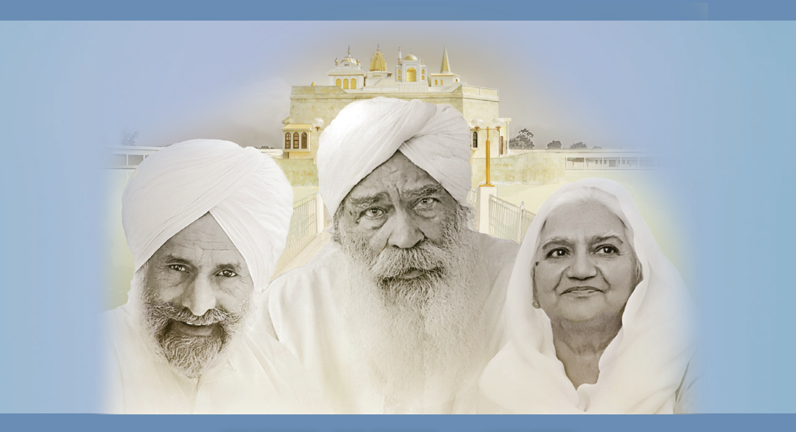
BE GOOD, DO GOOD, and BE ONE