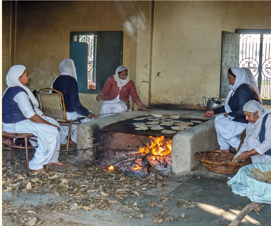
Chapatis in the oven, traditional flat bread made of wheat.