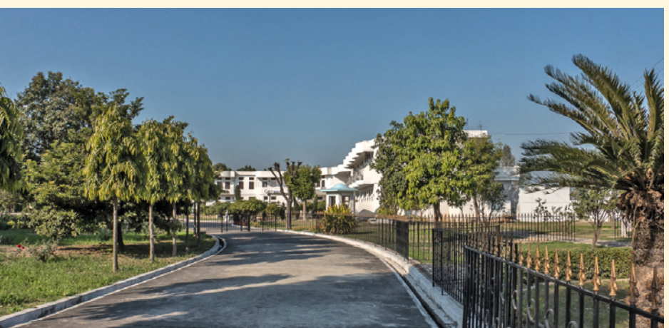
To meet the needs of the World Conference in 1994, a guest house was built. There the western visitors live during their stay.