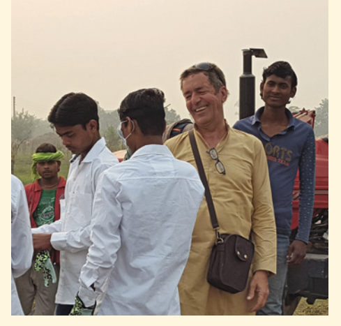
As speaker at agricultural seminar, which took place in Kirpal Sagar in November 2017.