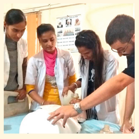
A ventilating training for nurses in the emergency room of the KS Charitable Hospitals took place on Nov. 02nd.